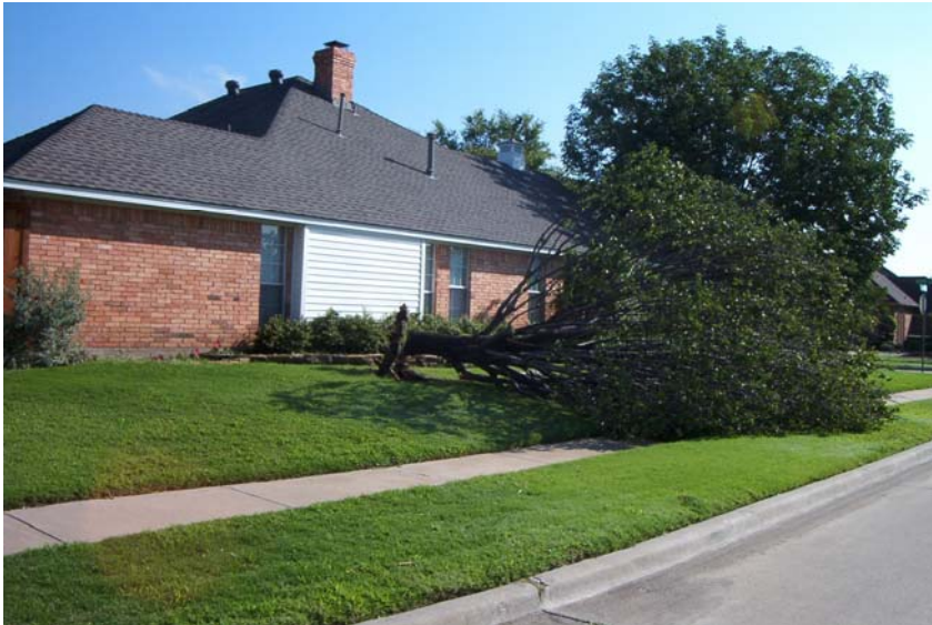
Winds Hard on Trees