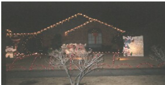
2809 Hickory Bend

Oakridge Citizens on Patrol logged over 704 hours during 2003. Hopefully, we can make 1,000 hours a goal for 2004, but, we will need additional volunteers-please make joining the C.O.P. your goal for 2004.