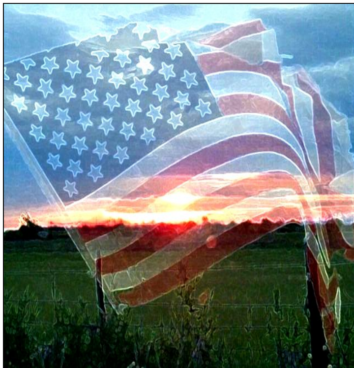
God Bless America

Mark that date on your calendar as it will be the first all Oakridge residents family picnic. See map on page 4 for additional details