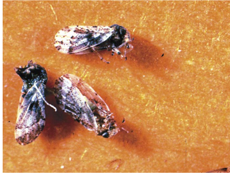
Photo of hackberry gall psyllids, Pachypsylla sp. (Homoptera: Psyllidae), adults.