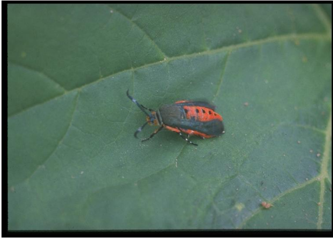
Southwestern squash vine borer, Melittia calabaza (Lepidoptera: Sesiidae), adult.

Squash vine borers are the most common and most damaging pests of squash. The larvae are borers so they will cause damage as they tunnel into the stems. They usually feed on squash and related wild plants but also can feed on melons and cucumbers.