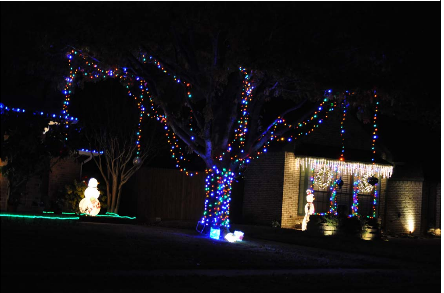
3118 Ridge Oak (left) & 2713 Oak Springs (above)