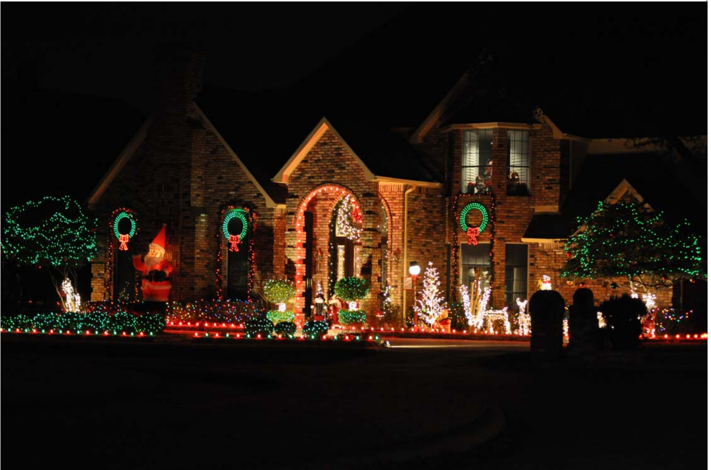
2605 Oak Point