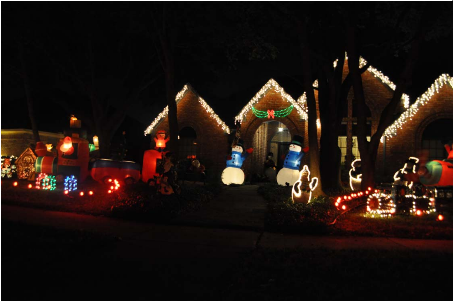
2306 Lone Oak Trail