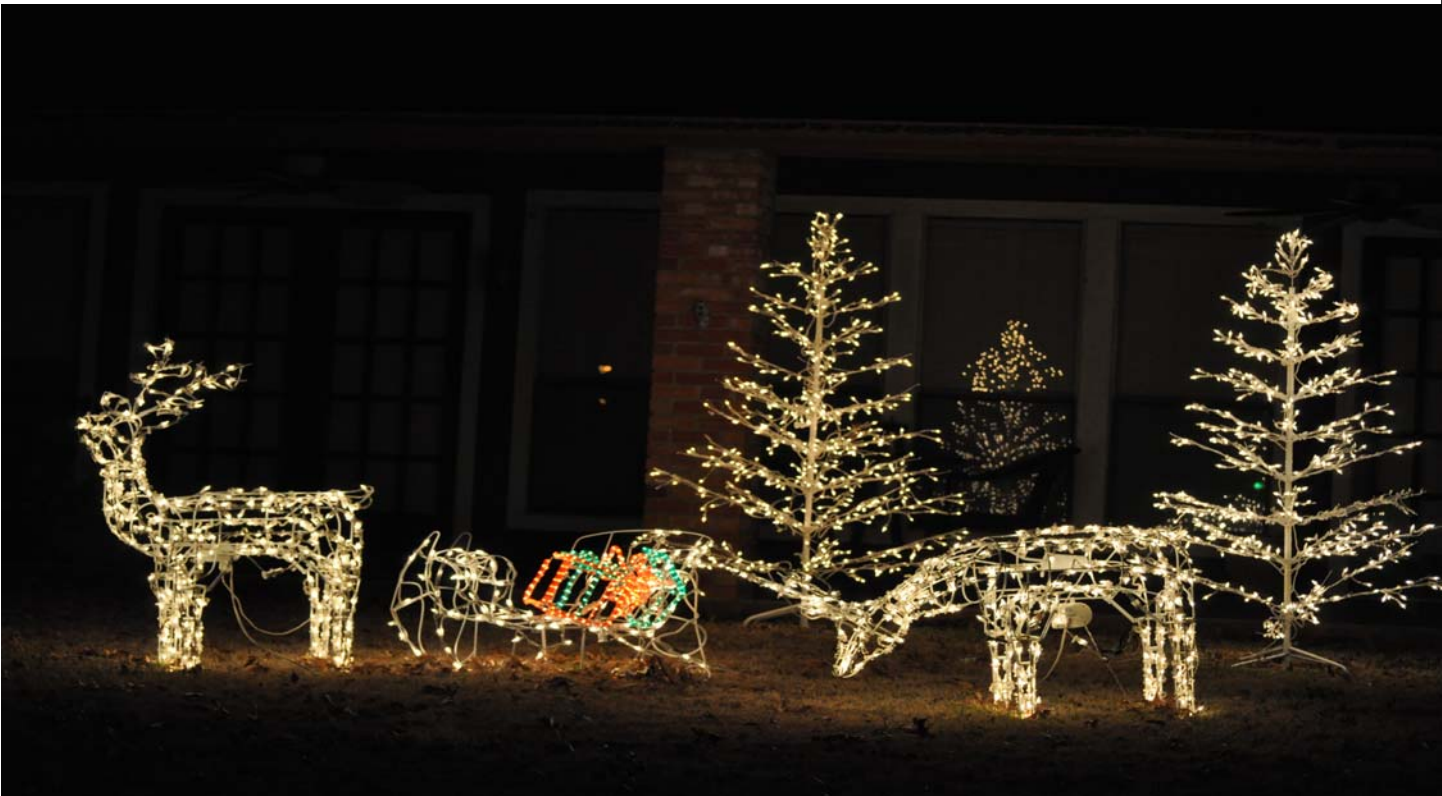
3101 Ridge Oak