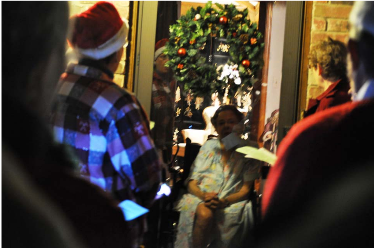
2703 Oak Point (left) & Christmas Caroling (above)