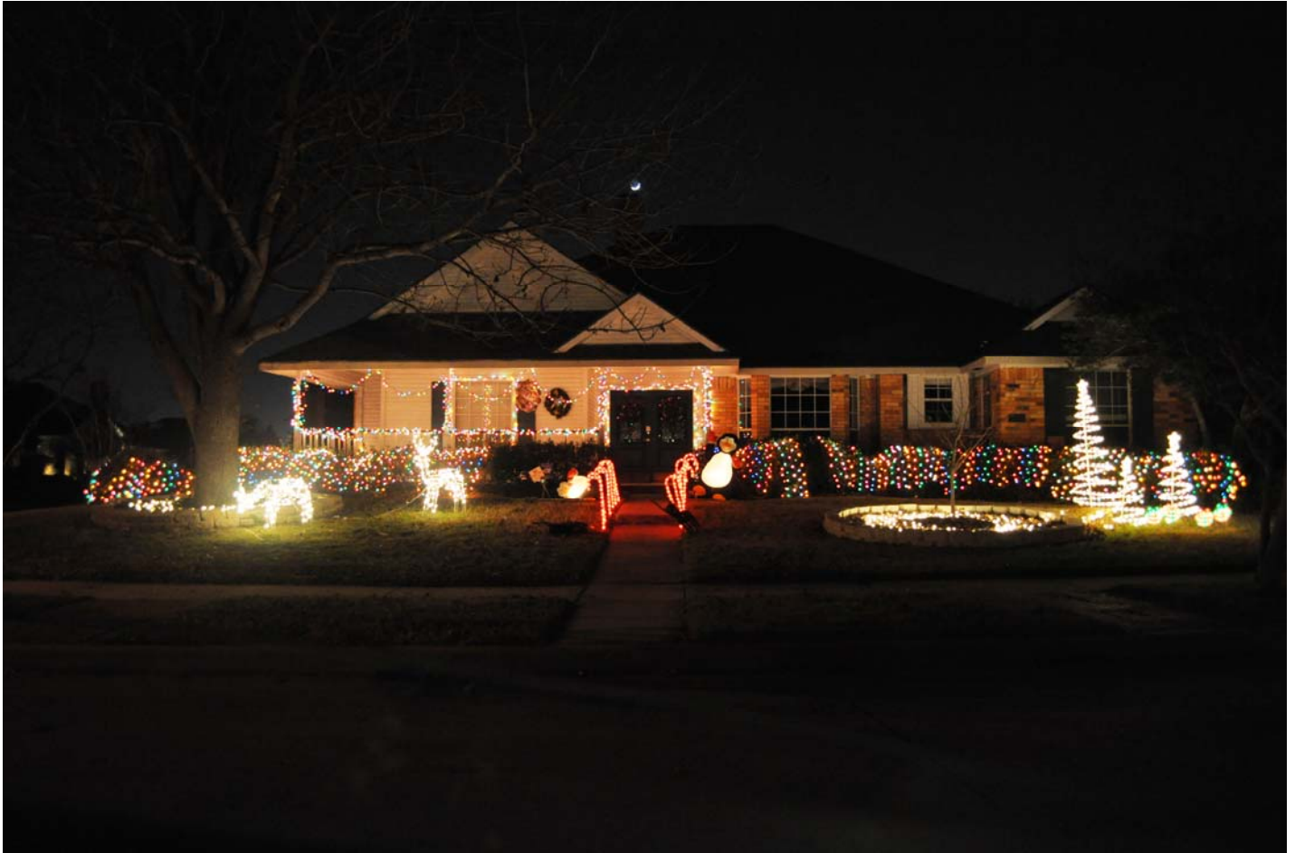
2301 Rocky Trail (Above) & 2814 Oak Point (Below)