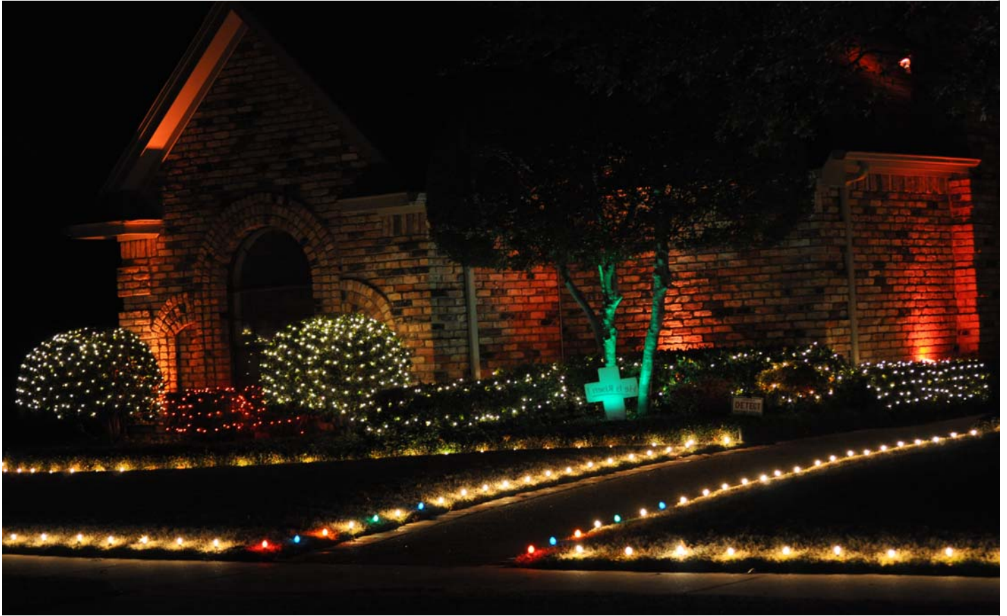
2613 Oak Point (above) & 3209 Bending Oaks (below)