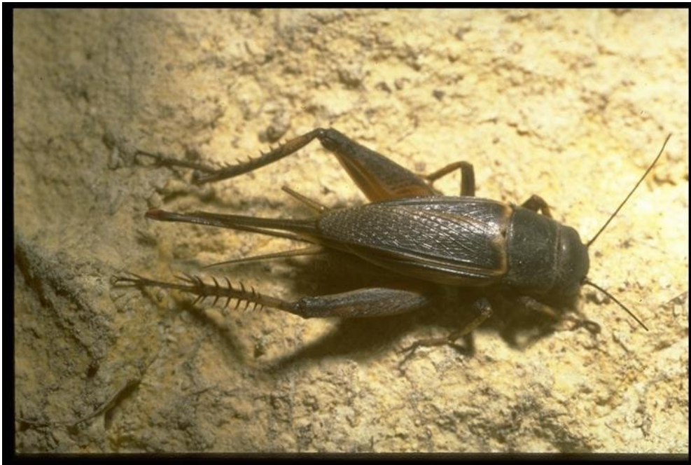
A field cricket, Gryllus sp. (Orthoptera: Gryllidae).

If a severe infestation exists, there are granular products that can be used for control, such as those containing hydramethylnon. There are also chemicals that can be sprayed outdoors to provide a barrier around homes, such as those containing pyrethrins or bifenthrin. There are also products that can be applied in indoor and outdoor cracks and crevices, such as those containing boric acid. Remember to dispose of dead crickets to reduce the smell and decrease the likelihood of ants feeding on the dead crickets.