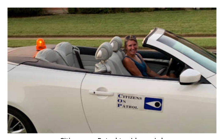
Citizens on Patrol to ride again! Look for them on your street soon.

We look forward to working with Academy and are interested in volunteer- each of you to keep our neighborhood the safe- safest in Texas. Contact us at safety@oakridgena.org to get involved.