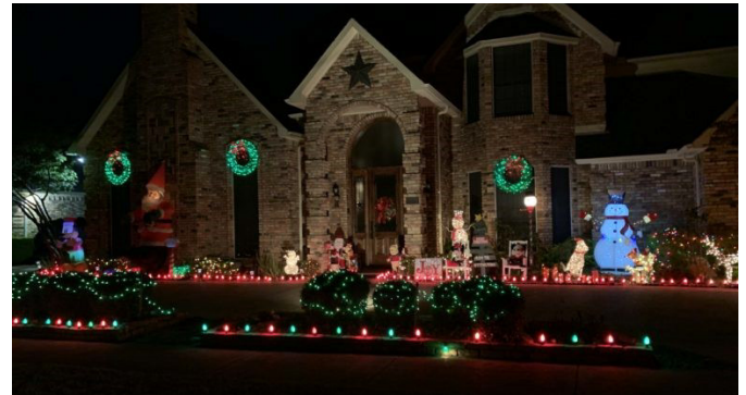
Most Kid Friendly —2605 Oak Point Drive