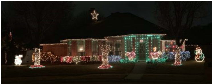
Best Overall—2001 Rolling Oak Drive