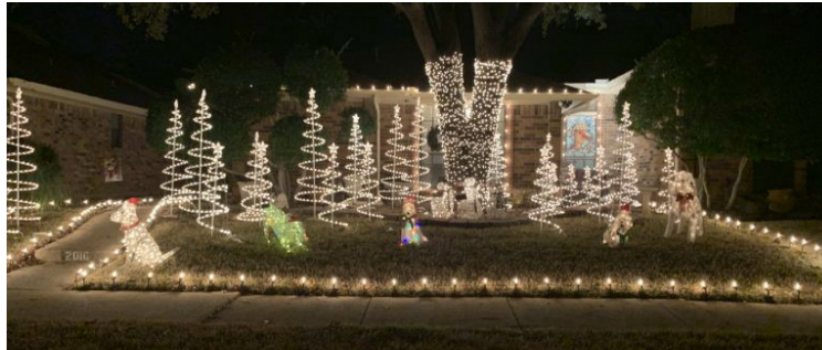
Best Traditional —2016 Hearthside Drive