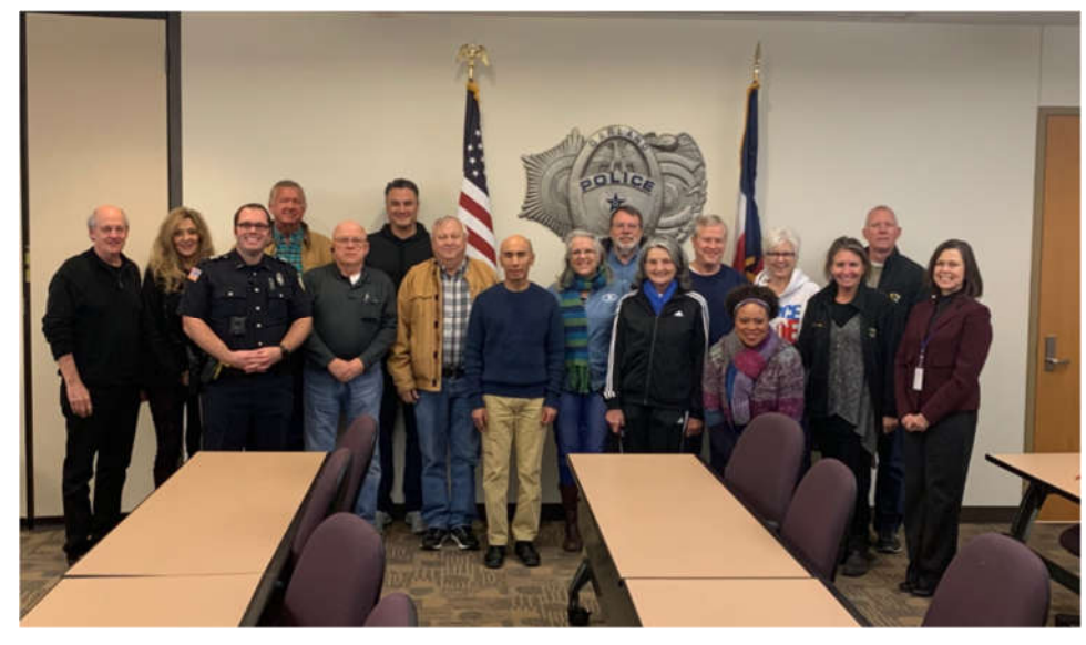
Congratulations to the January 2019 COP class

holds are part of Crime Watch by simply on the ONA Website at oakridgena.org. knowing your neighbors and calling 911 for an active crime or contacting the non-ry of active involvement of its members in emergency number at 972-485-4840 when you see suspicious activity.