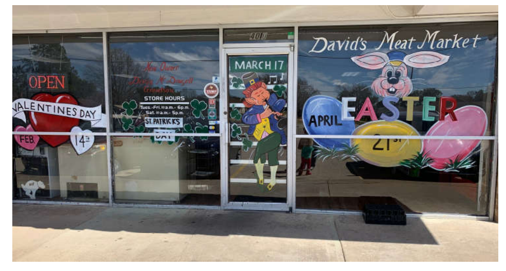
The current seasonal scene that adorns the windows of David's Meat Market.