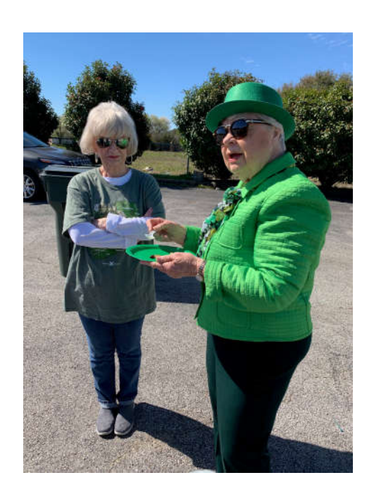
Thanks to all those who came out, brought food, and partied with us!