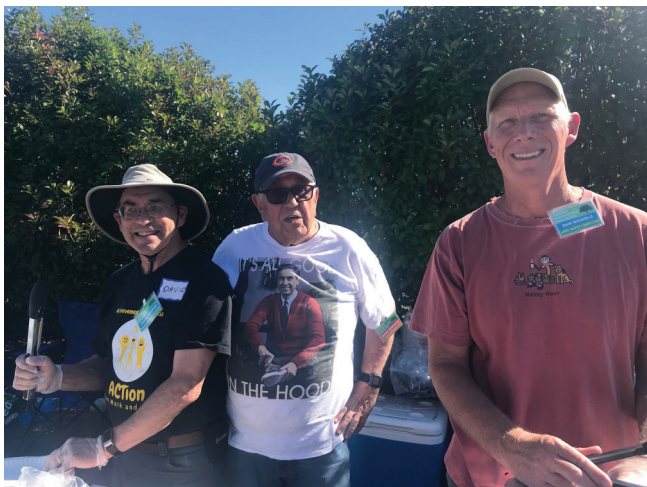
The Cooks/Chefs for the 2019 ONA Spring Fling

Grill/Chef/Cook (for neighborhood events) send an email to info@oakridgena.org