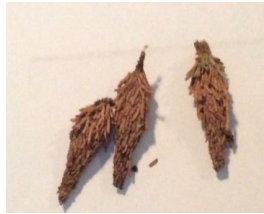
Bagworm Moth Cocoon